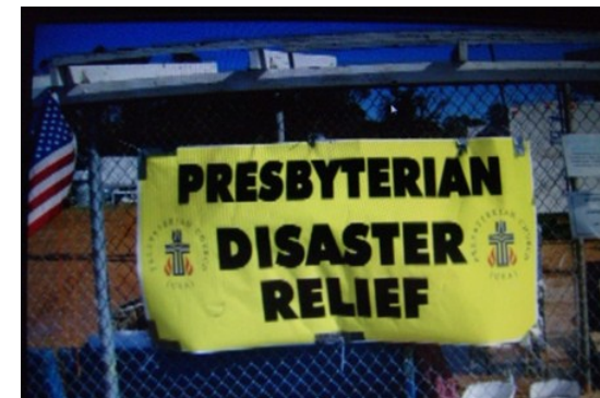
Entry sign at PDA camp used by an Assistance Team from Florida, Hurricane Katrina.