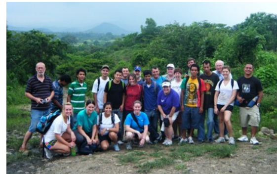
FPC Mission team members and Nicaraguan friends, 2010.

The vision for Global Missions is to engage all members of First Presbyterian Church to use their time, talent or treasure in serving God in order to meet physical, communal and spiritual needs of His people worldwide and demonstrate the fellowship and virtues of Christian life