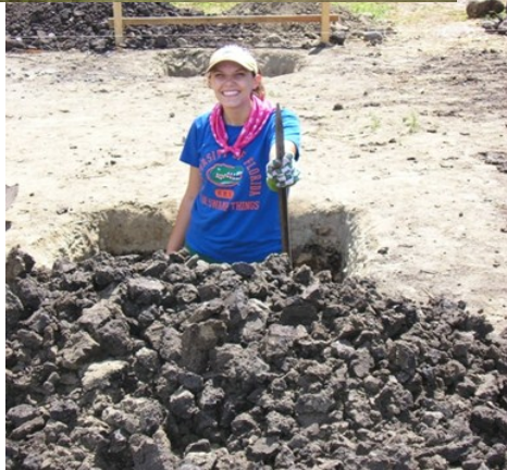
Mission team member digging footers for the Youth Ministry Center, 2006 and completed building, 2007